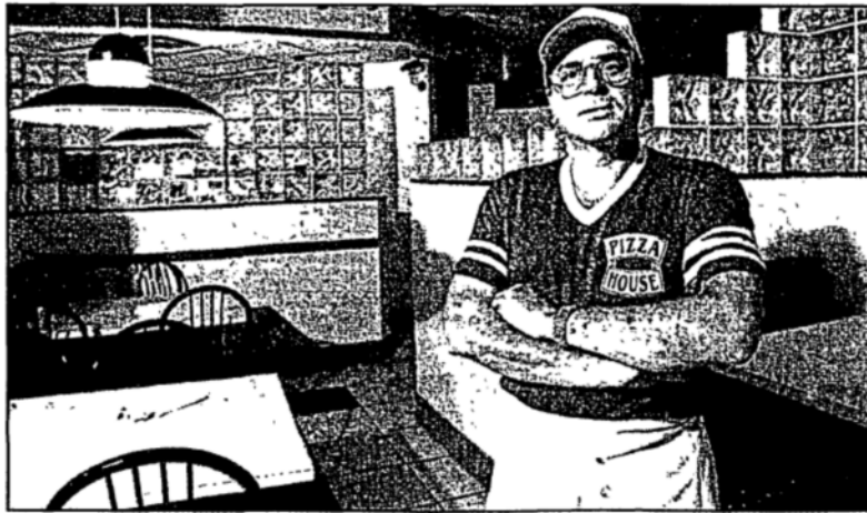
Tom Dodge / Dispatch

Pizza was in the name, but the menu was full-service Italian, including lasagna, ravioli and spa-