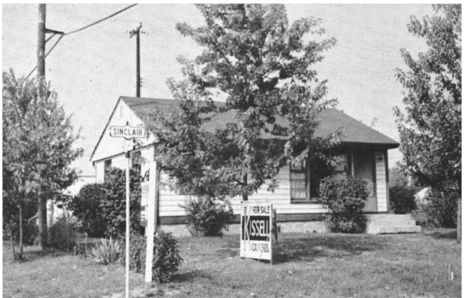
September 1960 real estate photo of original Pizza House location shortly before Pizza House occupied the space, at corner of Sinclair and Lincoln (where Luke's Auto is now located) - original address was 5379 Sinclair Rd.