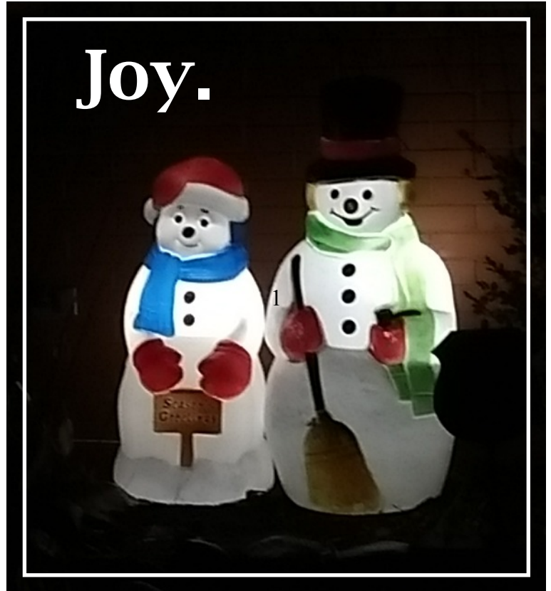
Christmas decoration in Salem.

Dinner begins around 7 p.m., followed by a rousing, perpetual game of bingo. This is a party you don't want to miss. We will also be taking memberships for next year at this meeting. I hope to see a lot of both familiar and new faces!!!